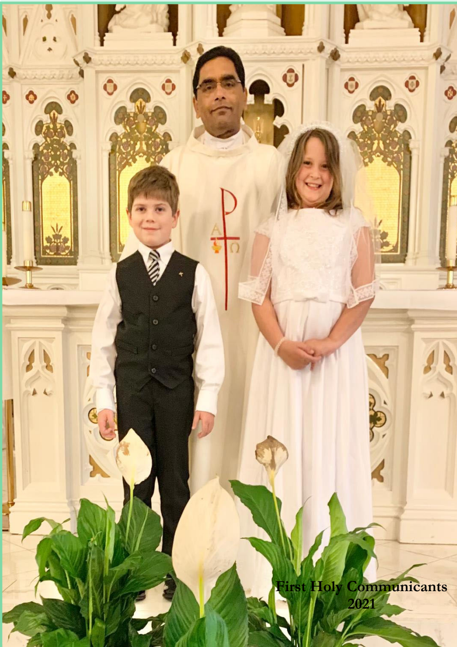
First Holy Communicants 2021