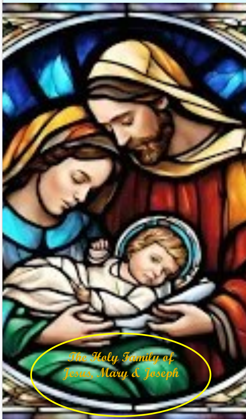
The Holy Family of Jesus, Mary & Joseph

December 31, 2023 The Holy Family Masses